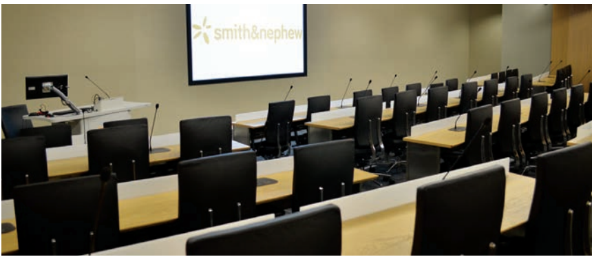
The learning path begins with theoretical-knowledge transfer through lecture, progresses to hands-on practice, and continues via our interactive kiosks and video wall, offering a blend of learning opportunities designed to help unlock the full potential of your staff, techniques and technology.